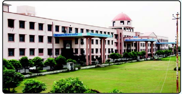
Rohilkhand Medical College