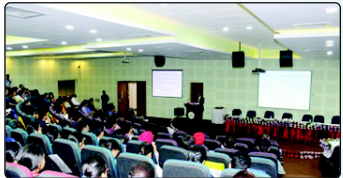
State of the Art Auditorium